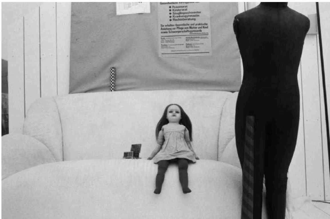
Kai Althoff, Untitled. 2011. Sofa, screen, mannequin, silk covered board with poster and drawing, kaleidoscope, doll, dead locusts, ormolu box and emerald stone brooch, gift wrap paper lined cardboard tube, lamp, dimensions variable. View of work at Kai Althoff: und dann überlasst mich den Mauerseglern (and then leave me to the common swifths), Museum of Modern Art, New York, 2016.

Visiting the exhibition at opening time, I was alone for a few minutes. The experience was disquieting, as if I had trespassed into the private hoard of a collector with sadistic tendencies. Althoff's imagination can be cruel. In Das Fleisch seiner Knochen (2002), a semi-nude man's knees rot away to reveal the bones beneath. The spectre of brutality lingers everywhere. Untitled (Grazing) (2001) sees young men grovelling on their bellies. A 1997 drawing has one man in a conductor's cap bestride another, clutching him by the back of his jacket. Even Althoff's calmer works seem to live in a haunted demimonde, where sinister goings-on occur behind tattered curtains.