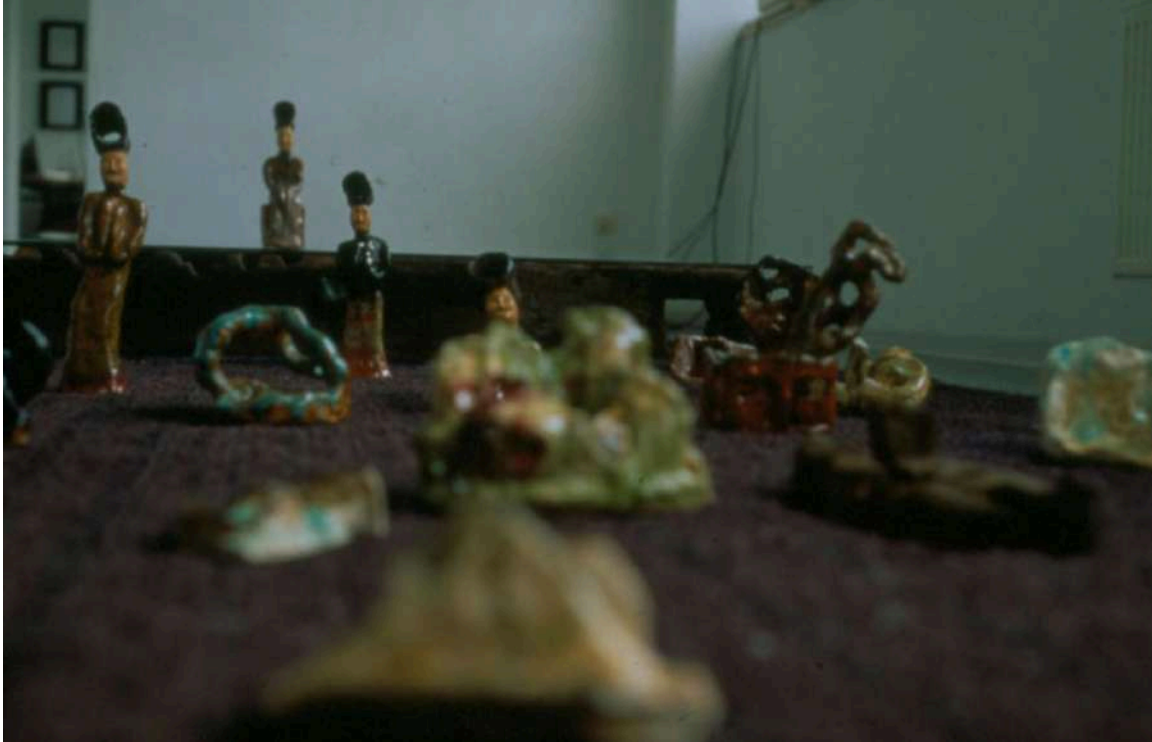
Kai Althoff. Hakelzug, 1994. Clay sculptures on sisal rug, two antique wooden beams from a loom, glass panel, wool, green wooden bucket, 178 x 247.5 x 32 cm. View of work at Galerie Christian Nagel, Cologne, 1994.

rambunctious comedy film. In recent years, however, the focus has been on paintings, drawings and collages, realised in a disparate array of methods, formats and materials.