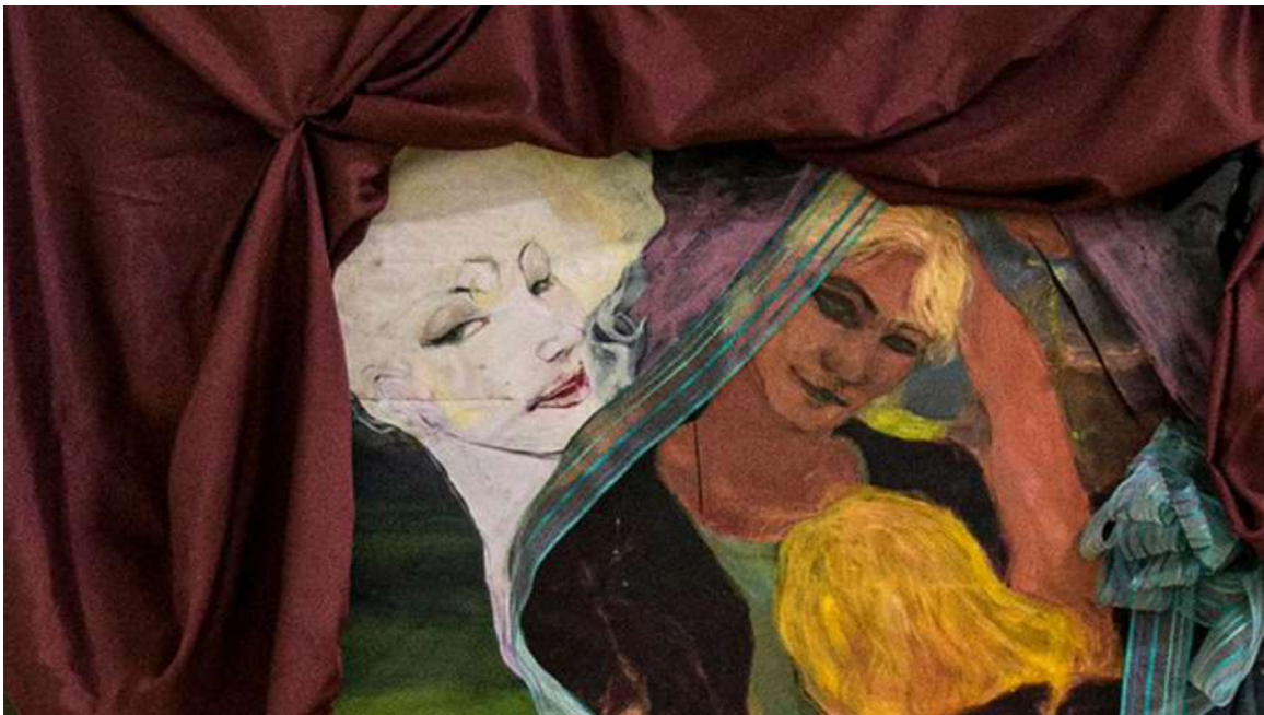
Kai Althoff Goes With Bernard Leach, installation view (detail), Whitechapel Gallery, London, 7 October 2020 – 10 January 2021.

Juxtaposing a sprawling selection of Althoff's works with a tribute to British studio pottery, the first UK survey of the perpetual enfant terrible raises more questions than it answers