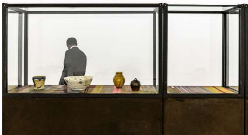
Kai Althoff Goes With Bernard Leach, installation view (detail), Whitechapel Gallery, London, 7 October 2020 – 10 January 2021.

This notion came under strain in 2018. A sequence of works displayed at New York's Tramps gallery was accused of drawing on orientalist stereotypes. Pieces from that series here reveal a complicated picture. Althoff undeniably draws on eroticised clichés: rows of submissive courtesans, recumbent young men, nude bodies prodded by the spears of warlords. Yet, as often as not, he often shows east colliding with west – a fearsome oni munching on a man is clearly based on Goya's Saturn – or dispenses with east Asian aesthetics altogether. Althoff seems less engaged in perpetuating particular stereotypes than drawing on visual history without limit. Whether he warrants the licence to do so remains an open question.