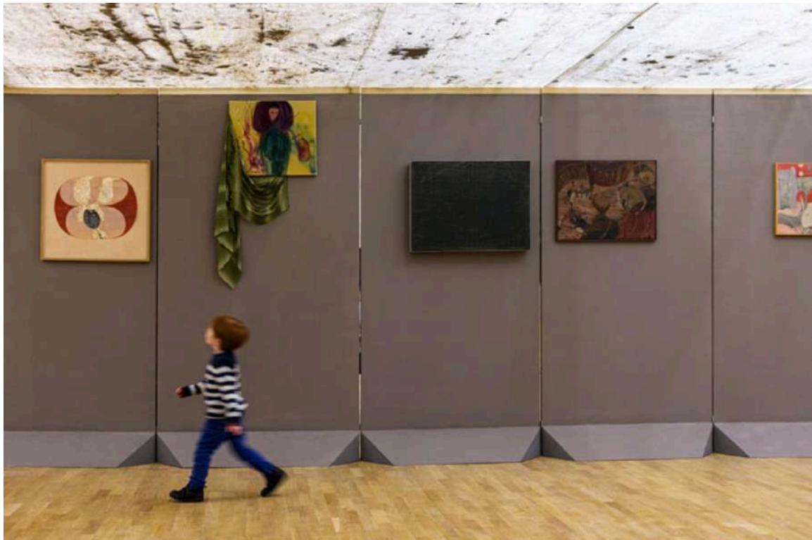
Kai Althoff Goes With Bernard Leach, installation view (detail), Whitechapel Gallery, London, 7 October 2020 – 10 January 2021.

Like many painters who emerged at the tail end of the 20th century, Althoff's style and subject matter seems haunted by the art of 100 years prior. But I am not sure that high art offers the clearest route into Althoff's bizarre world. His work seems instead to digest the half-remembered visual detritus with which human experience is strewn: album covers, psychedelic posters, comic strips, illustrated children's books. Some works have the lucid colouration of stained-glass windows in a postwar church. A pair of 2014 oil and enamel works showing pigs hidden within brown grooves resemble the sort of folk art you might find in a rustic gasthaus .