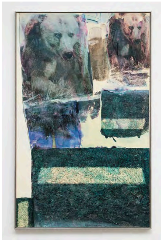
Robert Rauschenberg, Bear Grass [Anagram (A Pun)] (1999). Inkjet pigment transfer and graphite on poly laminate. 247.7 x 154.9 cm.

Hong Kong's M+ will present Robert Rauschenberg and Asia from November 2025–April 2026.