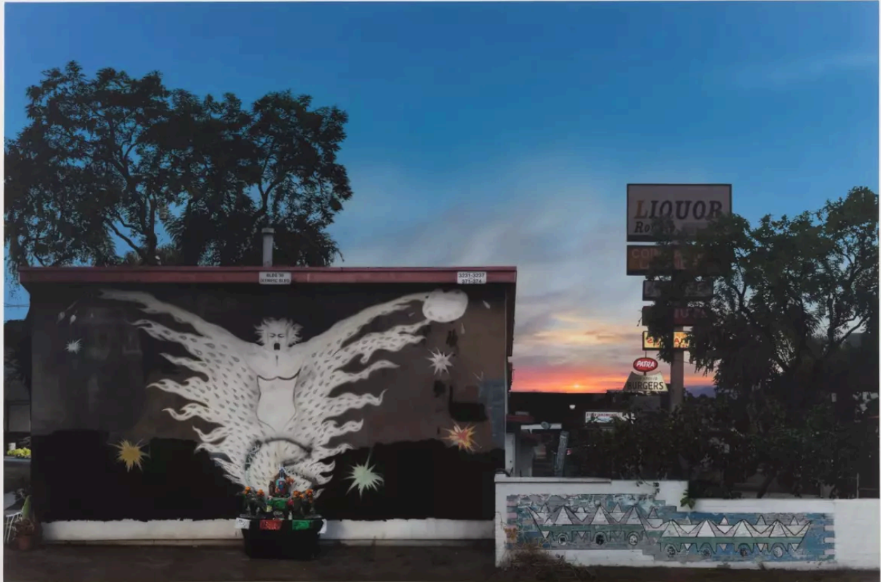
Sayre Gomez, "2 Spirits," 2024, acrylic on canvas. (Je McLane)

Omissions are puzzling too. An obvious list would include Robert Cottingham's signature landscapes of elaborate neon signage and Malcolm Morley's souvenir postcards of cruise ships and recruiting posters of naval destroyers. Perhaps most unexpected is the absence of Charles Bell's monumental toys and candy machines, which explode harsh photographic light, as well as Richard Artschwager's acute architectural constructions painted on Celotex board, a building material that serves as an ironic ground for precision pictures of offices being demolished or off-kilter tract homes.