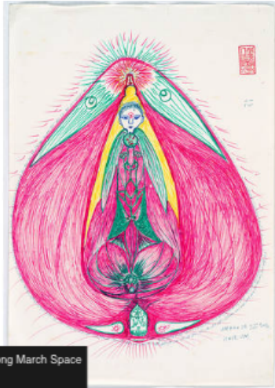
Guo Fengyi, Practicing Qigong, 1989

Another group of works charts the body's meridians and pressure points. But it is Guo's towering figures that steal the show, emanating powerful energies that seem to vibrate throughout the gallery.