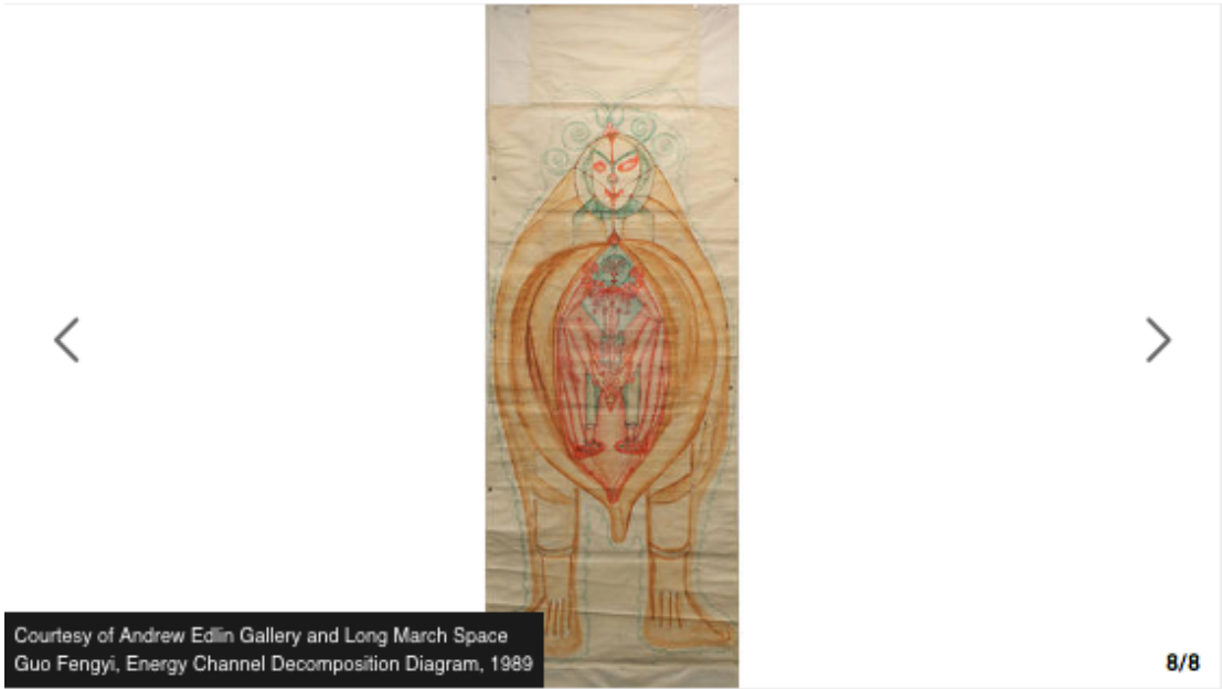
Guo Fengyi, Energy Channel Decomposition Diagram, 1989