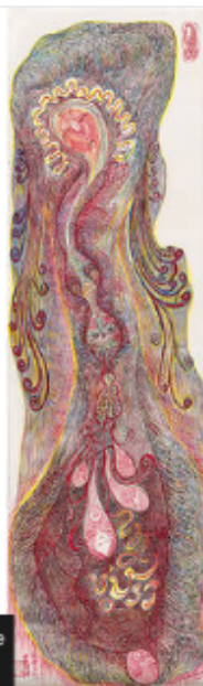
Guo Fengyi, Dunhuang Apsaras II, 1992