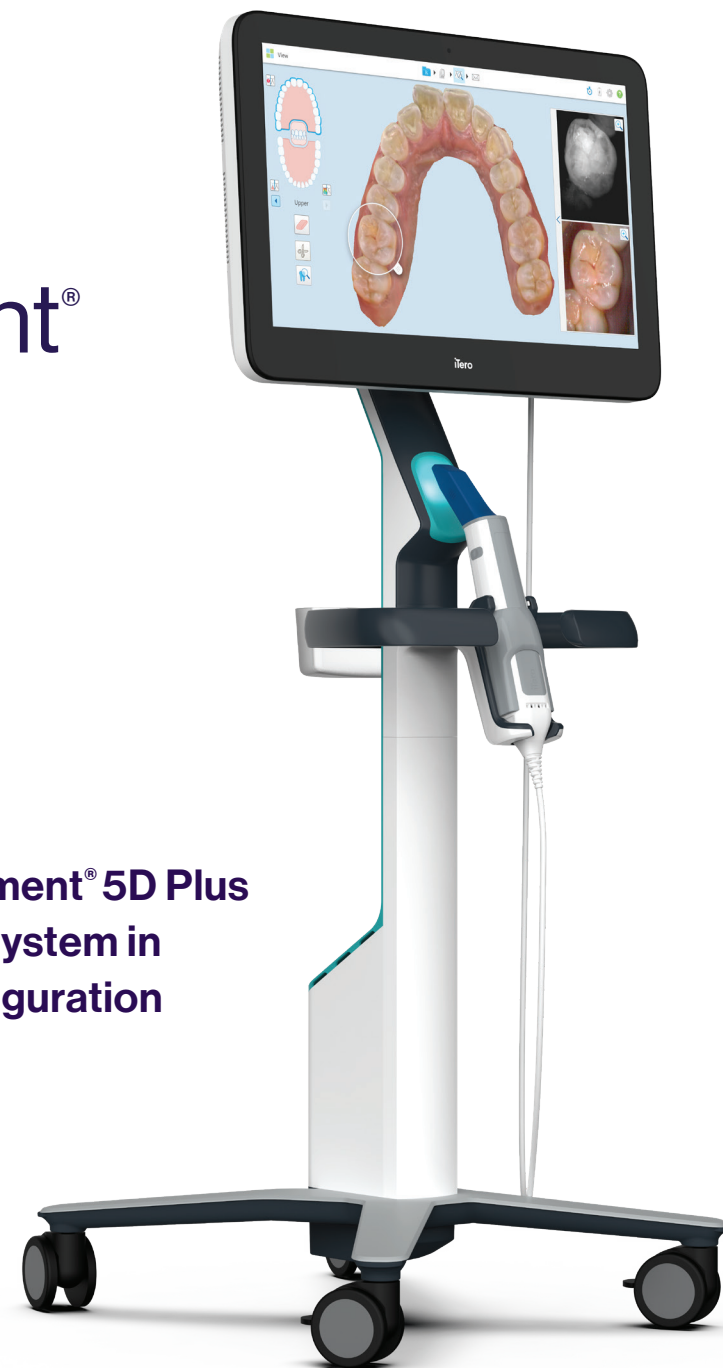
iTero Element® 5D Plus imaging system in cart configuration