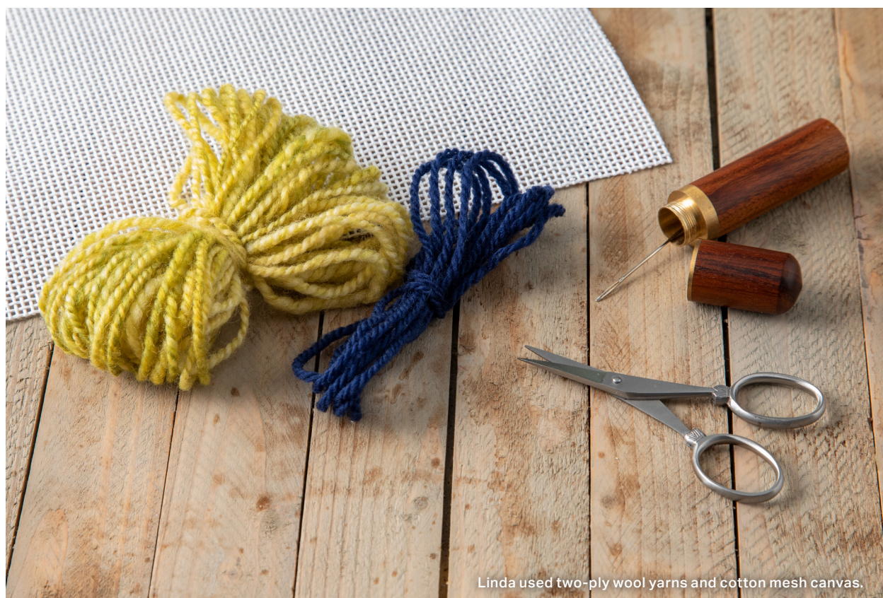
Linda used two-ply wool yarns and cotton mesh canvas.

Trim the canvas mesh so there is a ¾" seam allowance around the bargello stitching.