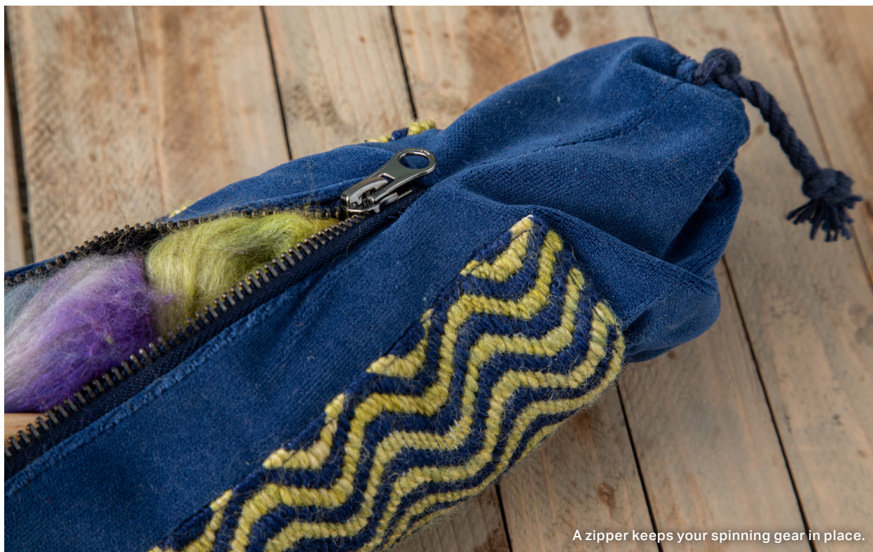
A zipper keeps your spinning gear in place.

Steam-press the seam allowances toward the wrong side so there is a smooth and straight rectangle (8" x 11") of only the bargello stitching showing.