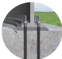
Above plinth design