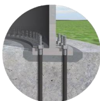
Shallow trench design