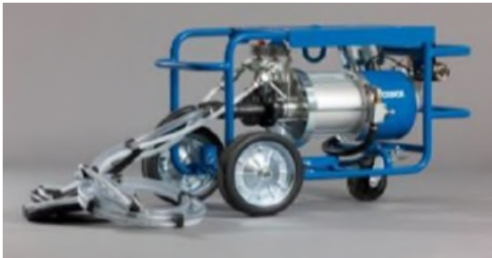
example of a two-component injection pump

Highly reactive, two component hydrophobic polyurethane injection resin for strata consolidation