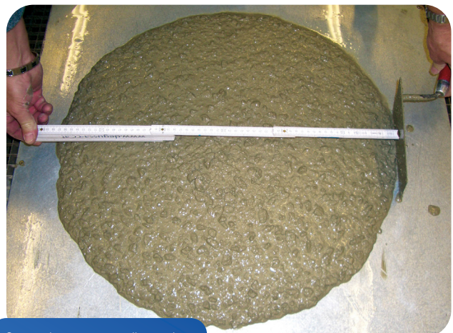
Sprayed concrete quality testing

A durable sprayed concrete lining is defined as one that performs in the working environment for the duration of its expected service life. Achieving good durability depends on a variety of factors, especially density and water/cement ratio. Each project requires an adapted solution based on customer requirements and local building material, and Master Builders Solutions® underground construction specialists are here to propose the right chemistry for a successful result. As a consequence of the growing use of sprayed concrete as a permanent construction material for tunnel linings,