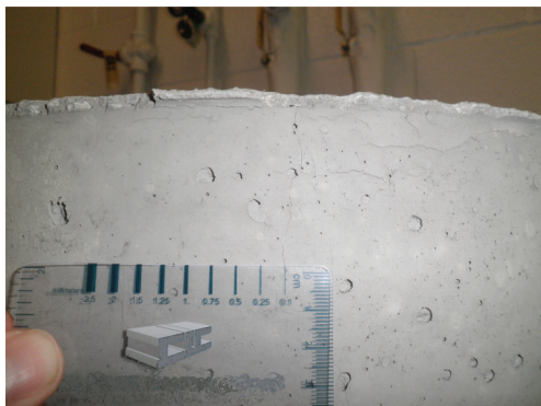
Crack width \approx 100 \mu\text{m} (0.1 mm)