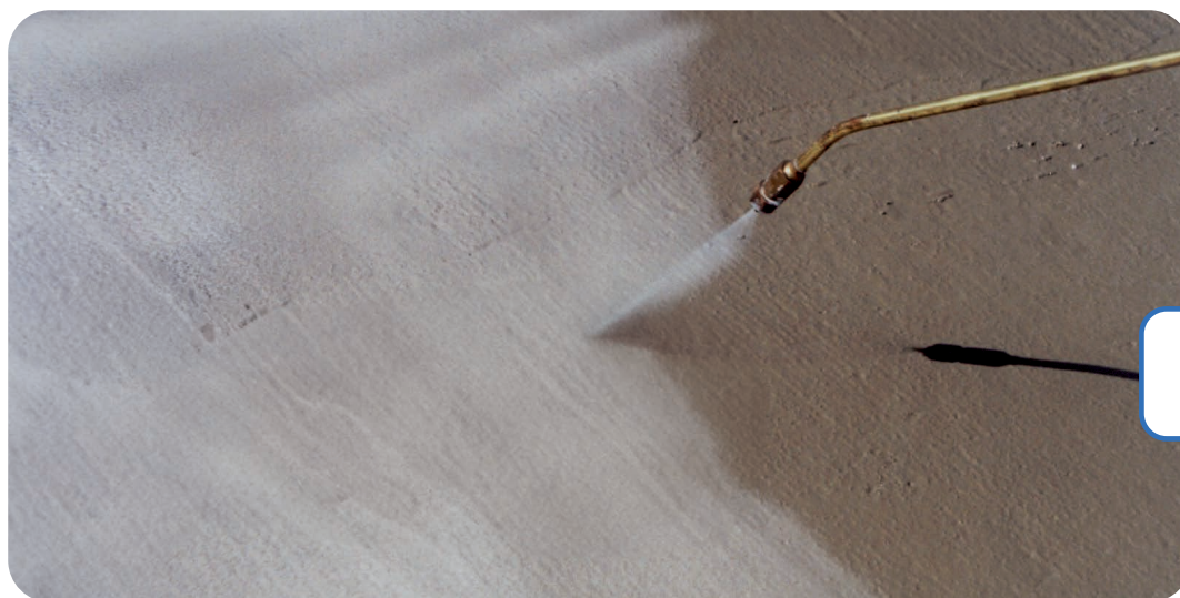
MasterKure® application on construction site after placing the concrete

The Master Builders Solutions® experts offer a comprehensive range of curing compounds. An evaporation reducer is recommended to ensure full hydration during the first few hours and to facilitate trowelling. Low emission curing compounds based on aqueous wax emulsions are extremely efficient, environmentally friendly and economical in use. White pigmented curing compounds serve the additional purpose of reducing temperature increases in concrete exposed to radiation from the sun. For high efficiency combined with early application and fast membrane formation, a product based on polymer resins dissolved in organic solvent offers the ideal solution.