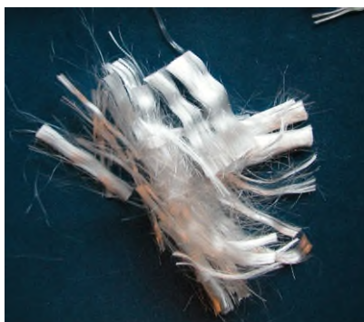
Synthetic micro-fibers MasterFiber 018

The distribution of the fibers inside the matrix occurs in the initial phase of mixing the flakes are dispersed uniformly in the cement matrix. Then the mix water dissolves the water soluble glue and the fibers are separated from the flakes and uniformly dispersed.