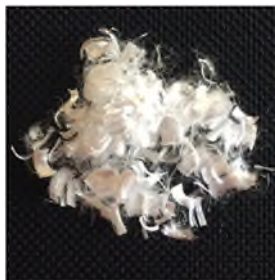
Micro Fibers MasterFiber 080