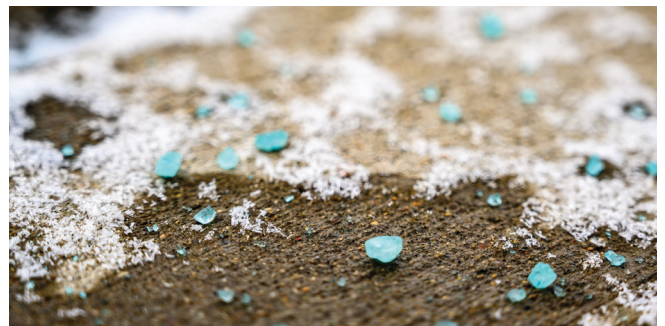
De-icers and freeze-thaw exposure of improperly air-entrained concrete are the main causes of scaling

Bottom line? For optimum appearance and long-term durability, MasterPel 200HD water-repellent admixture should be specified whenever exterior concrete is used.