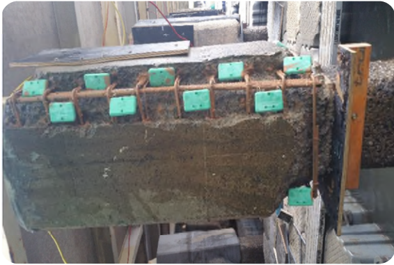
Beam repair preparation & installed MasterProtect 8065CP anodes