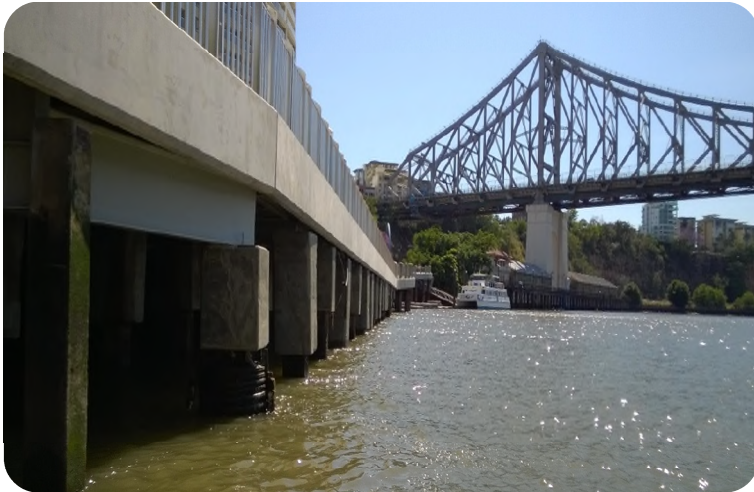
Brisbane's City Reach Boardwalk along Brisbane River