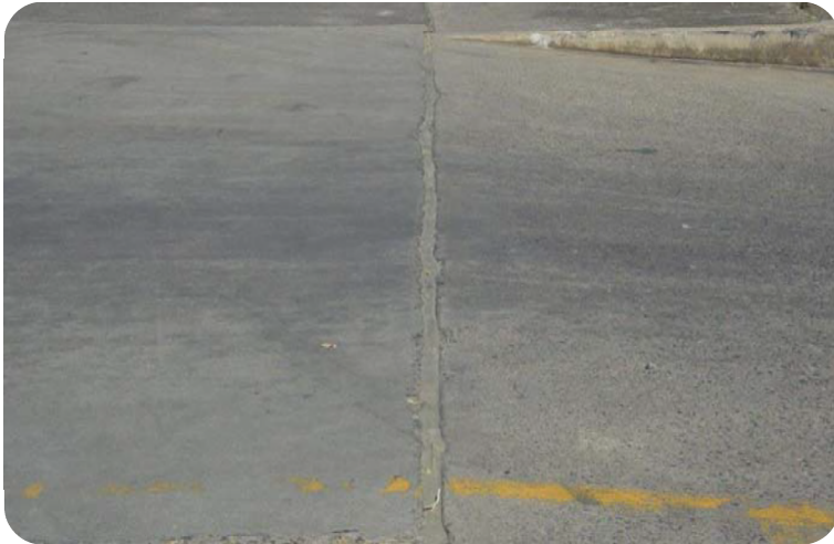
The repaired joint outside MB Solutions Seven Hills warehouse driveway