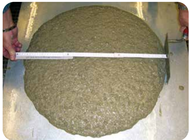
Sprayed concrete quality testing

As a consequence of the growing use of sprayed concrete as a permanent construction material for tunnel linings, demands on its durability have increased likewise. It offers more flexibility in terms of the geometry and space requirements. Permanent sprayed concrete is a requirement for the innovative composite shell lining design. See also our brochure on permanent sprayed concrete linings.