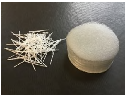
MasterFiber I 56 SPA polypropylene macro fibres

In compliance with the European Regulations (EU No. 305/2011 and EU No. 574/2014), the product is CE-marked in accordance with UNI EN 14889-2 and the relevant DoP (Declaration of Performance).