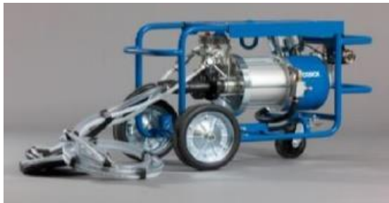
example of a two-component injection pump

Highly reactive, two component hydrophobic polyurethane injection resin for strata consolidation