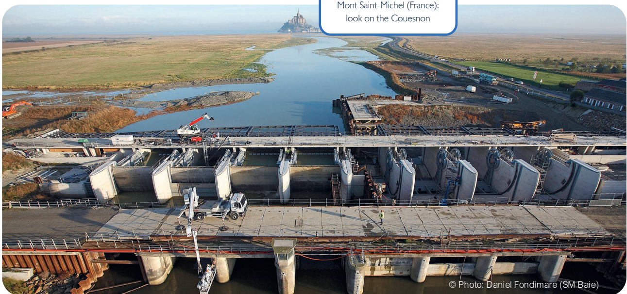
Mont Saint-Michel (France): look on the Couesnon