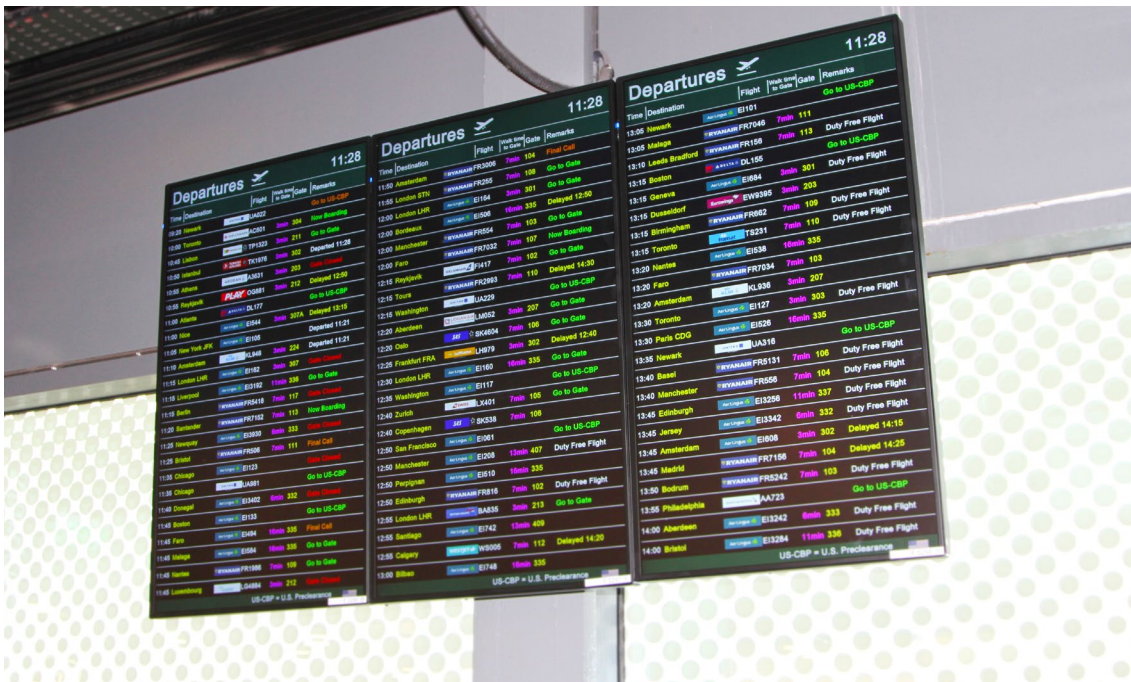
FLIGHT INFORMATION SCREENS

The images below show what the screens look like and where to find your gate number. Gate numbers are displayed on these screens before departure time, on dublinairport.com and the Dublin Airport app. There are travelators to help reduce the amount of walking for passengers departing from Gates 100 - 121 and Gates 401 - 426 . (See map of terminals on last page for approx. walk times to gates and Section 8 for mobility supports). All gates have a seating area for passengers awaiting boarding.