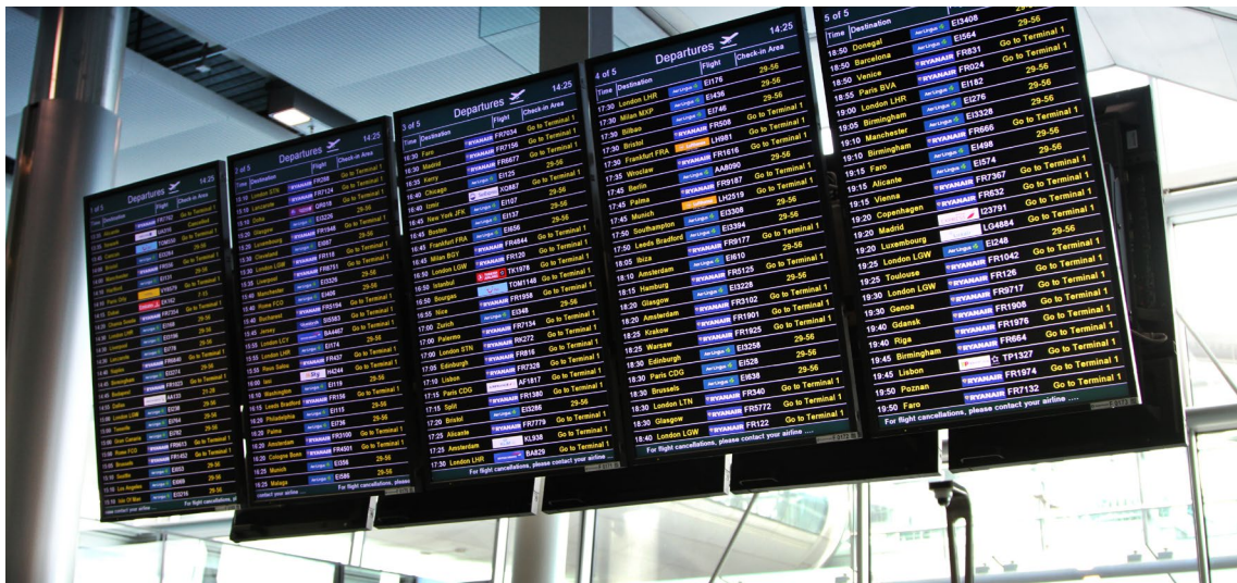
CHECK IN AREA SCREENS

You may have checked in online and have your boarding pass already – either stored on your mobile phone or printed on a page. If you have your boarding pass, do not have a bag to check in and have not booked mobility assistance, you can go directly to Security Screening. If you need to get or print your boarding pass and/or are checking in a bag or if you require a visa check, you can do so at one of your airline’s check in desks or Self Service Kiosks (SSKs). Each airline uses a specific area of the terminal to check in passengers. To find out where your airline’s check in desks are, look at the screens located around the terminal. The image below shows how the information is displayed.