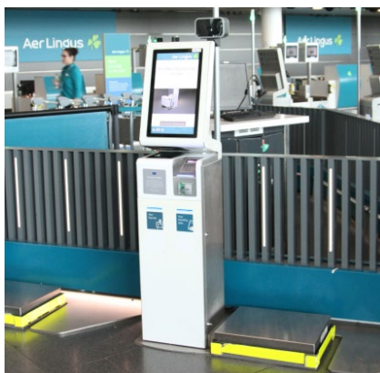
SELF SERVICE KIOSK (SSK)

Some airlines also have a self-service bag drop facility. If you are unsure how to use the SSK or need assistance at any stage, please ask an airline staff member; they are working in the area and available to help. You will need your passport or travel document to check in. When you are travelling to the US from Dublin Airport, there are some additional steps in the check in process which your airline will manage for you at their check in desks.