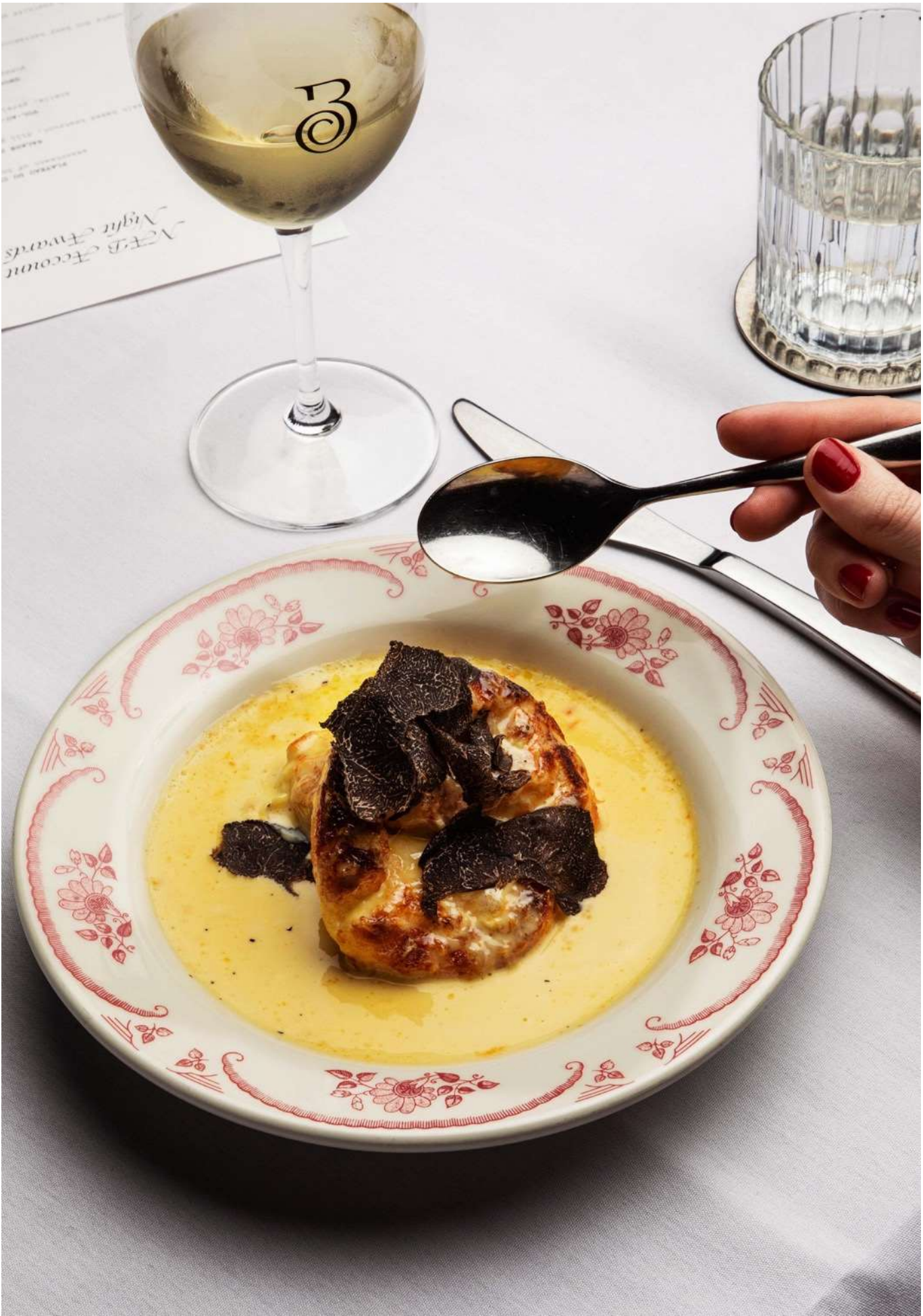
Sample menu – subject to change

◆ Optional upgrades to supplement a course dish