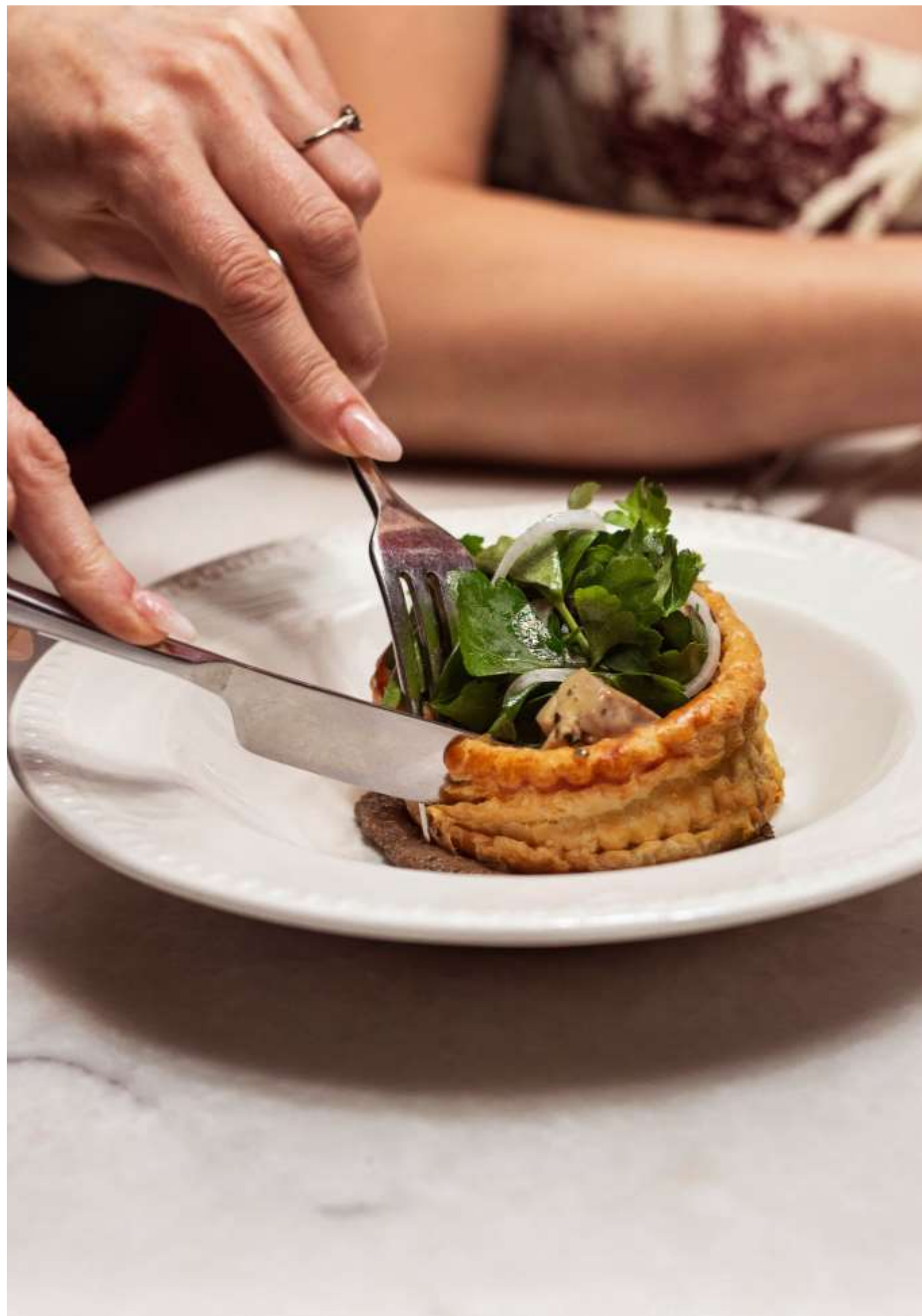
Sample menu - subject to change