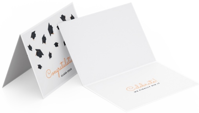
Page 1: Outside