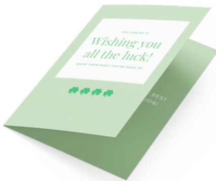
Page 1: Outside

Bottom Half: This is the inside cover. Leave blank or rotate 180 degrees (upside down).