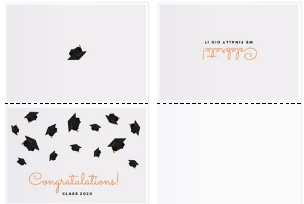
Page 2: Inside