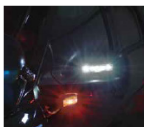
Full white steady burn or just the takedowns