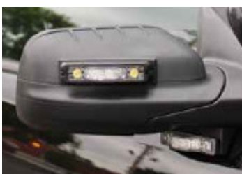
Both mirror mounting options above (Single colour shown)