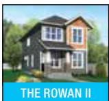
THE ROWAN II