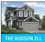
THE HUDSON ZLL