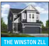
THE WINSTON ZLL