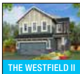
THE WESTFIELD II