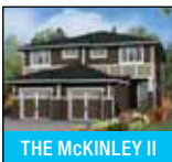
THE McKINLEY II