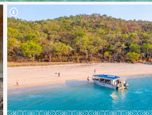
IMAGES 1 Mangroves on Stanley Island by Quentin Chester | 2 Green sea turtle, credit Ian Morris | 3 Viewing rock art at Somerset Bay | 4 Remote beach landings by Xplorer