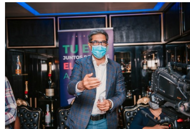
CEOs made commitments to provide support