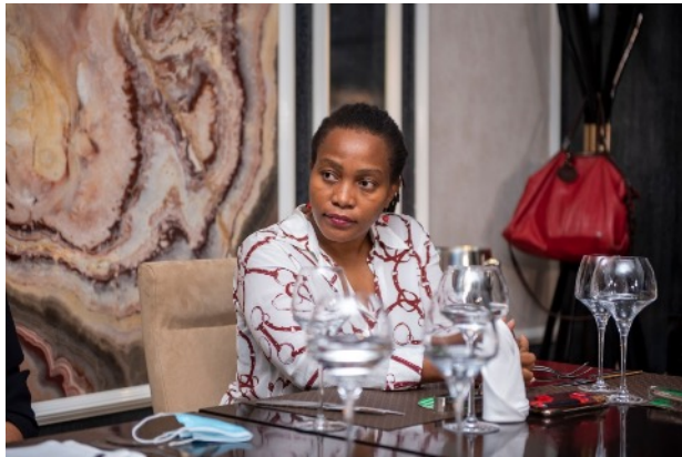
Telecom & Media industry leaders discuss how to end malaria