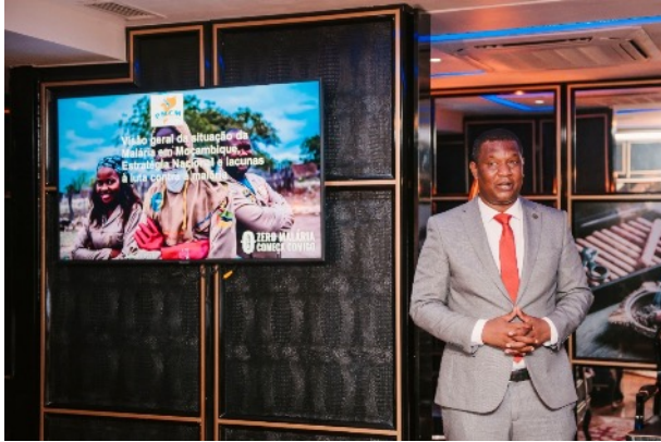
Secretariat presents on the Fund