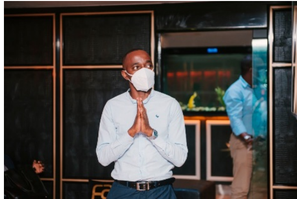
The NMCP sensitises the executives on the burden of malaria and the gaps that they face