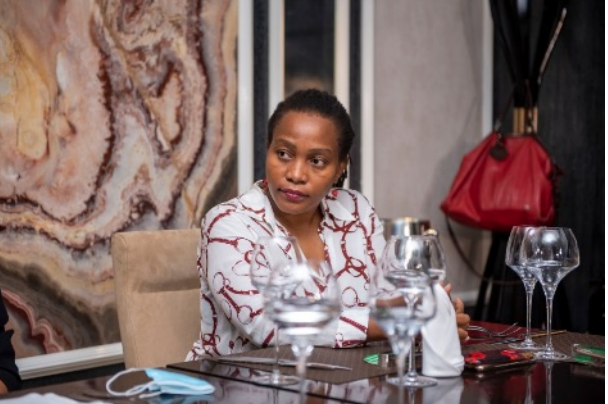
Telecom & Media industry leaders discuss how to end malaria