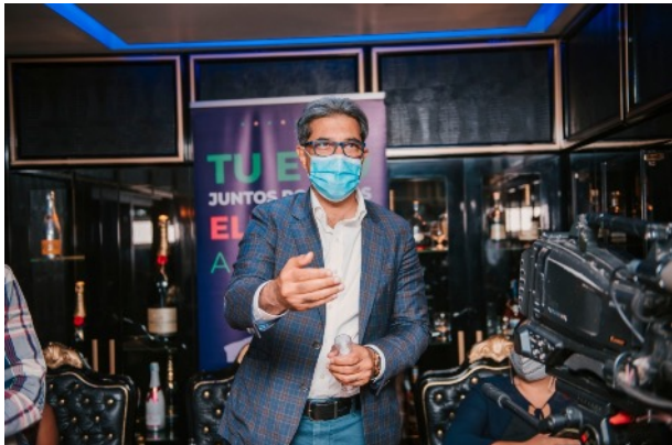
CEOs made commitments to provide support