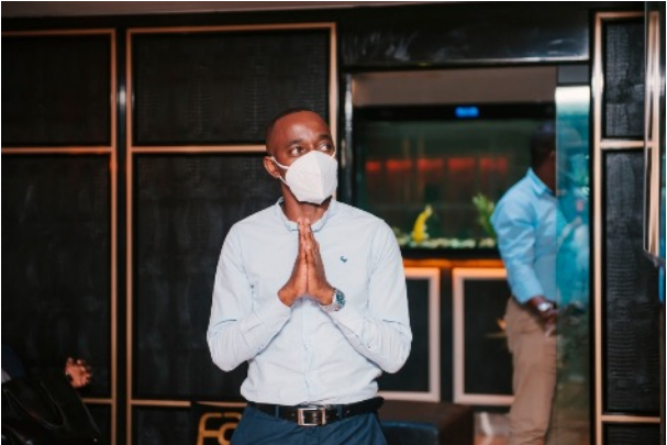
The NMCP sensitises the executives on the burden of malaria and the gaps that they face