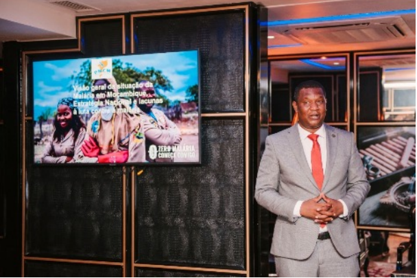
Secretariat presents on the Fund