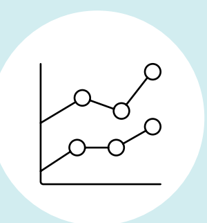
03 View your ongoing and completed war trips