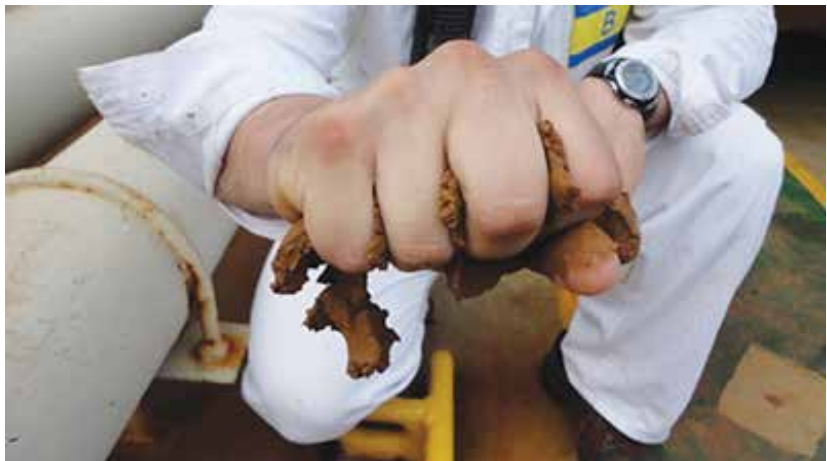
Market forces appear to be driving ships to carry cargoes that may liquefy.

Whilst unreliable shippers' declarations and certificates may be at the heart of the problem, this is complicated by several other problems, some of which are discussed below.