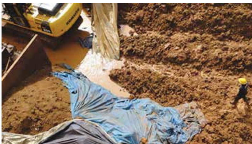
The on-board rectification of cargo moisture levels is far from straightforward.

If cargo is loaded and subsequent concerns arise as to its fitness for safe carriage, there is the obvious problem of identifying within the bulk what parts of the cargo are unfit. Often, therefore, the whole bulk has to be discharged. However, it can be extremely difficult to get cargo re-discharged at the place of loading. This may be because of a lack of facilities to take cargo back: in some remote locations cargo is bulldozed into barges from ashore and whilst cargo can be off-loaded to barges with the ship's cranes, shippers may have a problem getting it back ashore. There may also be complications caused by local customs regulations, which may consider a cargo to be exported once loaded. Quite often, when owners find their ships with unsafe cargo on board, lawyers are instructed and legal battles with charterers and others ensue. The on-board rectification of cargo moisture levels is far from straightforward. Many attempts, using various techniques, have been carried out but with limited success, particularly in holds that are full.