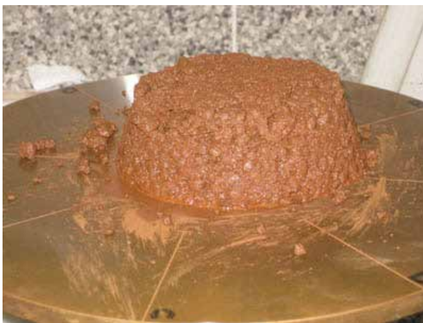
Flow table test.

Prior to start of loading, the shipper must declare to the Master in writing