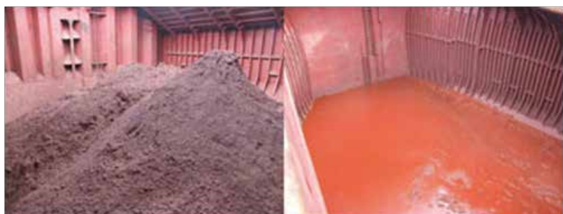
Iron ore fines before and after liquefaction.

In cargoes loaded with a moisture content in excess of the FMP, liquefaction may occur unpredictably at any time during the voyage. Some cargoes have liquefied and caused catastrophic cargo shift almost immediately on departure from the load port, some only after several weeks of apparently uneventful sailing. While the risk of liquefaction is greater during heavy weather, in high seas, and while under full power, there are no