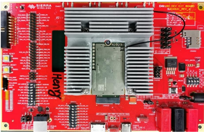
Figure 2 Test Sample and Heatsink (bottom aluminum heatsink 75X74.5X12 mm, area 31005 mm 2 )

The following test setup is for maximum UL/DL throughput of Sub-6 EN-DC mode. Lower throughput may need less combination of below materials. For example, to test Sub-6 1CC + LTE 4CC, 4 x 4 MIMO, one MT8000A and two MT8821C are required.