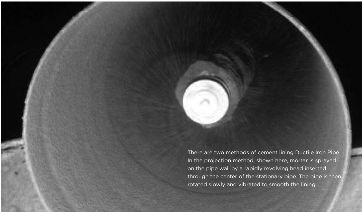
There are two methods of cement lining Ductile Iron Pipe. In the projection method, shown here, mortar is sprayed on the pipe wall by a rapidly revolving head inserted through the center of the stationary pipe. The pipe is then rotated slowly and vibrated to smooth the lining.

The 1995 revision expanded the section on cement to include types of cement other than Portland, expanded the size range to include 3-inch through 64-inch pipe, and allowed the manufacturer the option of providing the cement-mortar lining with or without a sealcoat unless otherwise specified.