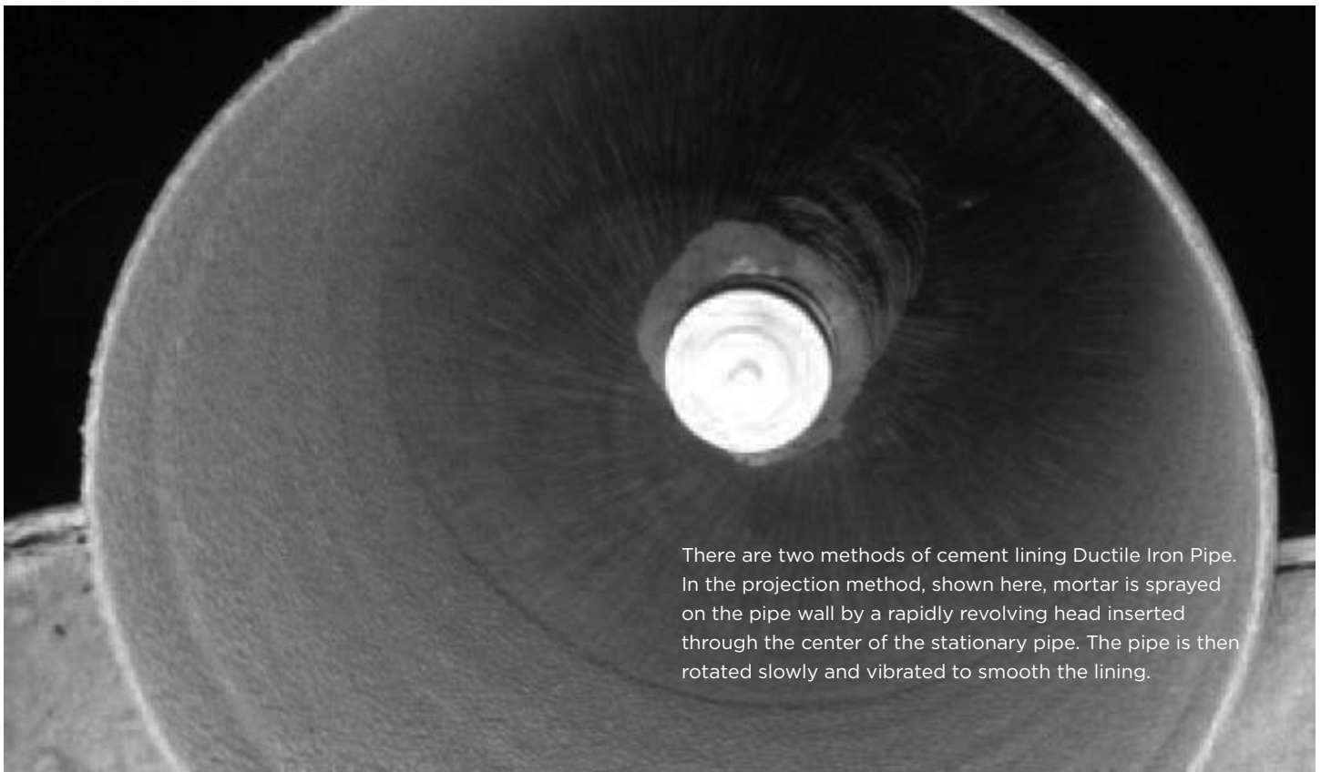
There are two methods of cement lining Ductile Iron Pipe. In the projection method, shown here, mortar is sprayed on the pipe wall by a rapidly revolving head inserted through the center of the stationary pipe. The pipe is then rotated slowly and vibrated to smooth the lining.

The 1995 revision expanded the section on cement to include types of cement other than Portland, expanded the size range to include 3-inch through 64-inch pipe, and allowed the manufacturer the option of providing the cement-mortar lining with or without a sealcoat unless otherwise specified.