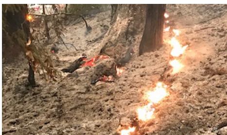
High-density polyethylene (HDPE) pipe burning in the CZU Lightning Complex Fire. 4

The map shows the rough boundary of San Lorenzo Valley Water District in Felton, Ben Lomond, Boulder Creek and other areas. The system encircles an area where Big Basin Water Co. provides water around Highway 236. (San Lorenzo Valley Water District) 5