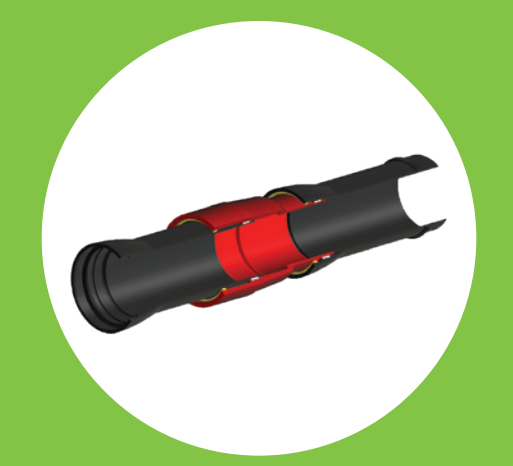
American Earthquake Joint System