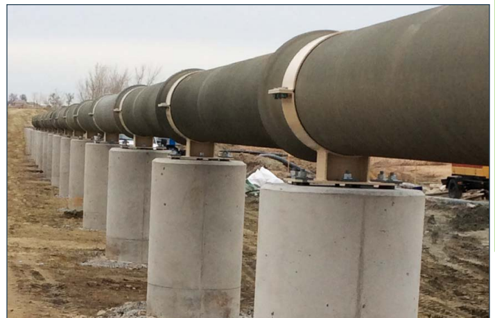
Ductile Iron Pipe is well-suited for use in pipe-on-supports applications due to its tremendous beam strength.

Various schemes have been successfully used to obtain longer spans where particular installation conditions presented the need, but these are special design situations and are not specifically addressed in this article. The design presented herein is based upon support per length of pipe.