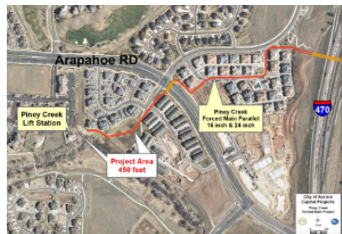
The above image shows the location of the Piney Creek force main.

“won’t use PVC again for wastewater discharge systems” after having seen the issues that resulted in the PVC pipe not being able to handle the cyclic loading. After dealing with all the challenges the PVC break at the Piney Creek lift station brought and seeing the success of the Ductile iron pipe installed at the Shop Creek Facility, the water department now only uses Ductile iron pipe for similar projects and applications.