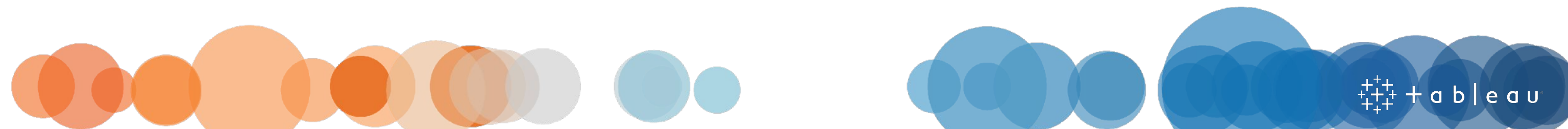
Tableau Foundation will cover the cost to send selected employees on-site with our grant partners for 2-3 weeks.

Typically a volunteer will support through mentoring, coaching and training nonprofit partners on Tableau products.