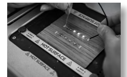
Test your prototype, iterate and repeat.