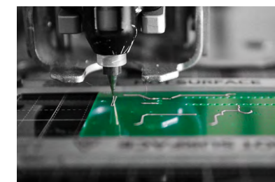
Drill, print, solder and reflow your board