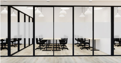
Corridors and meeting rooms

Price includes shipping, handling, & installation. Taxes not included but will be charged on final invoice.