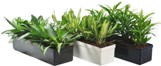
Table Model Mixed Bowl