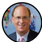
Laurence Fink Chairman & CEO