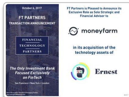
Moneyfarm Acquires the Technology Assets of Ernest