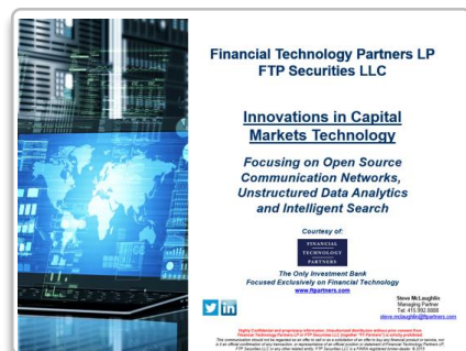
Research Report: Innovations in Capital Markets Technology