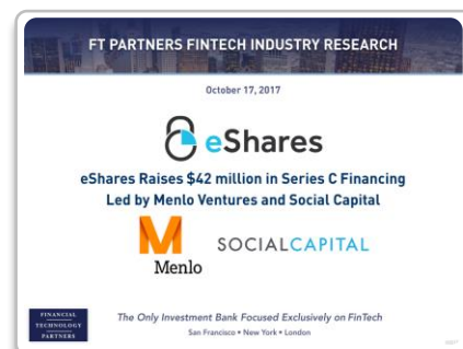
eShares Raises $42 million in Series C Financing