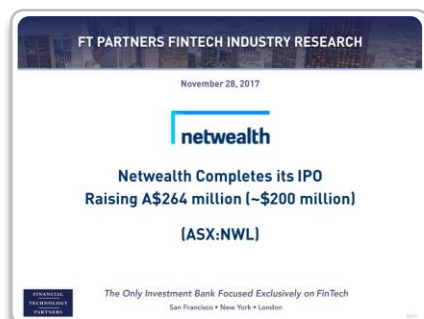
Netwealth Completes its IPO Raising A$264 million