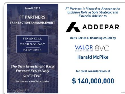
Addepar's $140 million Series D Financing