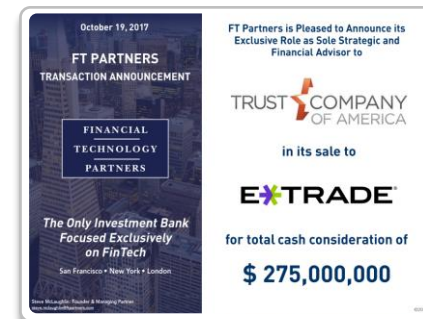
TCA's $275 million sale to E*TRADE