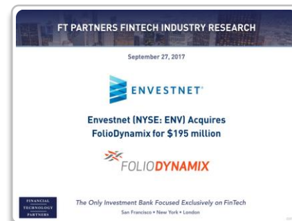
Envestnet Acquires Foliodynax for $195 million