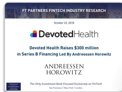
Devoted Health Raises $300 million in Series B Financing