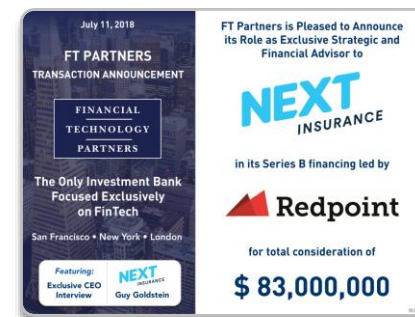
Next Insurance's $83 million Series B Financing