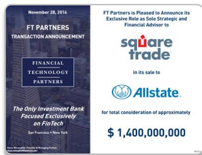
SquareTrade's $1.4 billion Sale to Allstate