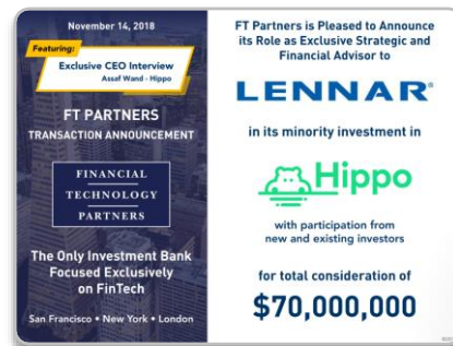
Lennar's Co-Lead Investment in Hippo