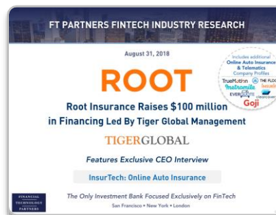
Root Insurance Raises $100 million in Financing