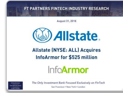
Allstate Acquires InfoArmor $525 million