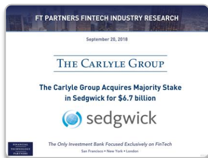
The Carlyle Group Acquires Majority Stake in Sedgwick for $6.7 billion