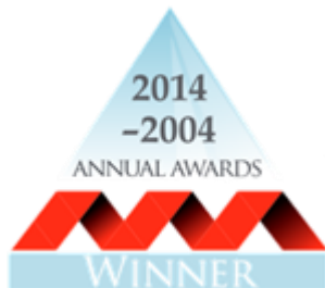
M&A Advisor Awards

FT Partners has been recognized as Investment Banking Firm of the Year and regularly achieves Merger and Financing Deal of the Year recognition