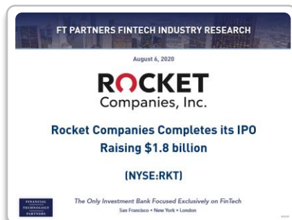
Rocket Companies Raises $1.8 billion in its IPO