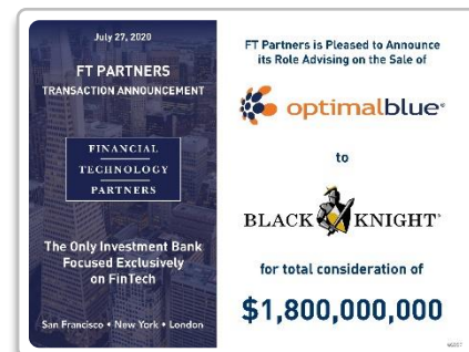
OptimalBue's $1.8 billion Sale to Black Knight