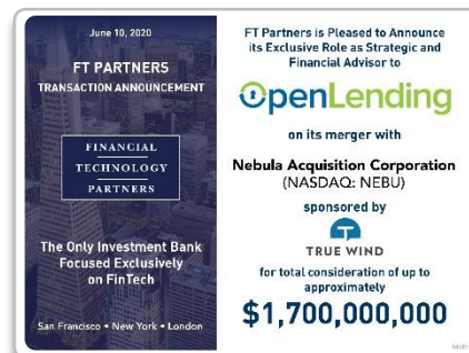
Open Lending's Merger with Nebula Acquisition Corp.