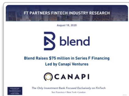
Blend Raises $75 million in Series F Financing