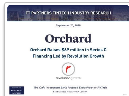
Orchard Raises $69 million in Series C Financing