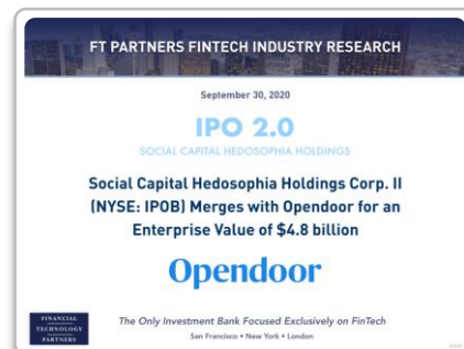
Opendoor Merges with Social Capital Hedosophia II