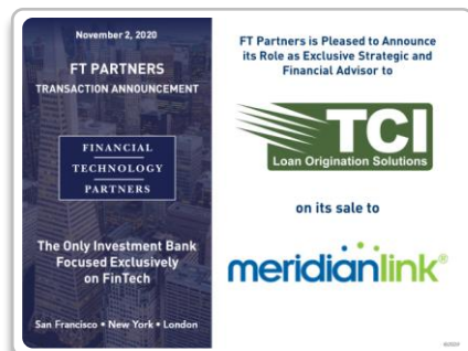
TCI's Sale to MeridianLink