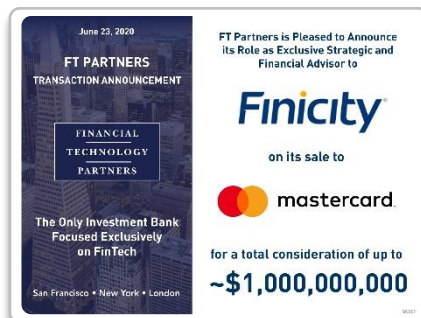
Fincity's $1 billion Sale to Mastercard