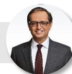
Vikram Pandit CEO

"Fair Square's combination of credit card industry expertise with advanced analytics has quickly made it the first significant 'CardTech' business."