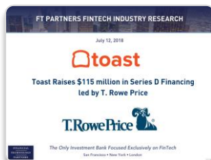
Toast Raises $115 million in Series D Financing