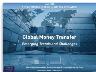
Global Money Transfer