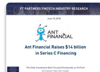
Ant Financial Raises $14 billion in Financing