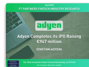
Adyen's €947 million IPO