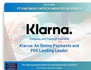
Klarna: An Online Payments and POS Lending Leader