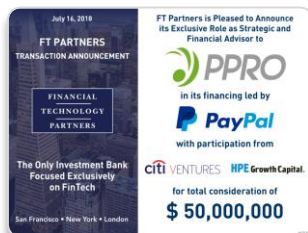
PPRO Raises $50 million in Financing Led by PayPal