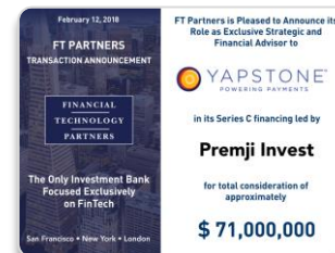
YapStone's $71 million Series C Financing