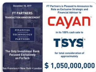
Cayan's $1.05 billion Sale to TSYS