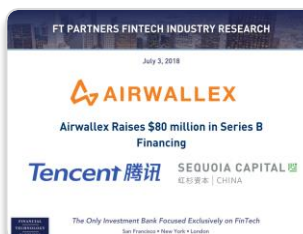
Airwallex Raises $80 million in Serie B Financing