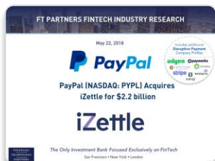
PayPal Acquires iZettle for $2.2 billion